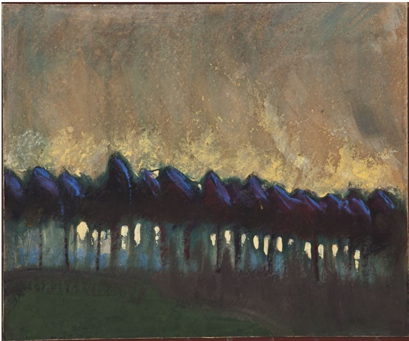
Forest | M. K. Čiurlionis | tempera on cardboard, 1906