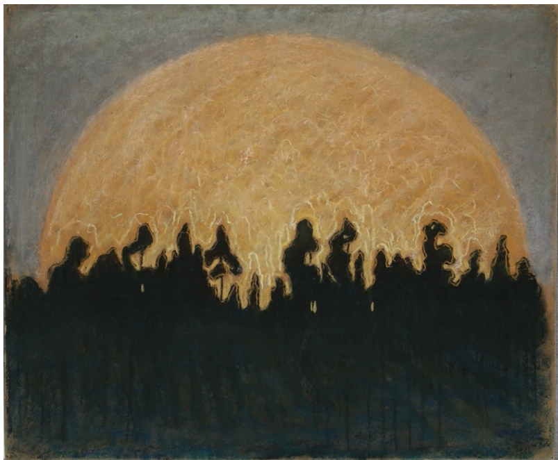
The Sun | M. K. Čiurlionis | pastel on paper, 1907