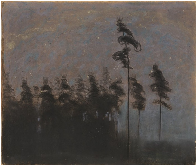
Forest | M. K. Čiurlionis | pastel on paper, 1907