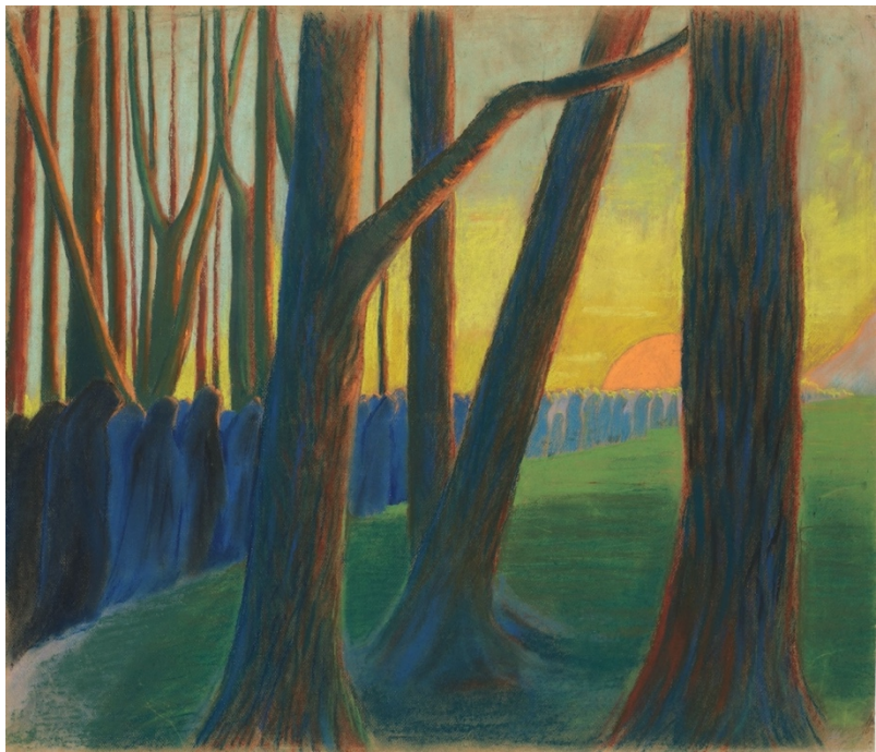
Funeral Symphony III | M. K. Čiurlionis | pastel on paper, 1903